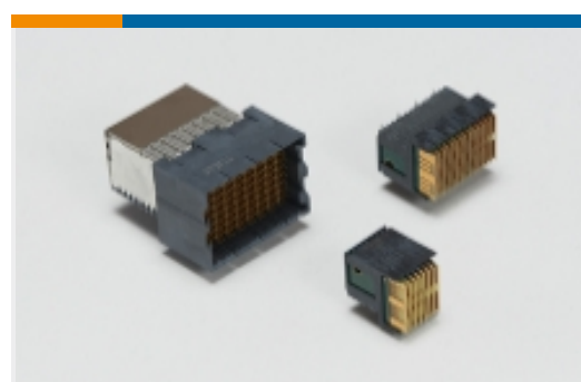
High Speed Backplane Connectors (1769)