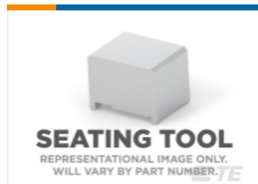
TE Part # 2018381-1 TOOL, SEAT 3 PR 16 COL, BP CONN